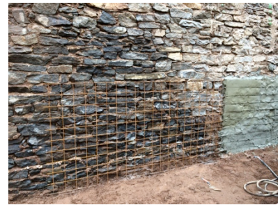
Preparation for Underpinning of 6-Story Tenement Building