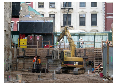
Soldier Beam & Timber Lagging Wall