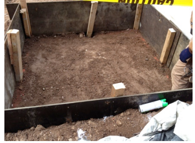
Footing Subgrade Preparation