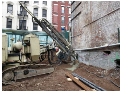
Stabilization of Neighboring Foundation