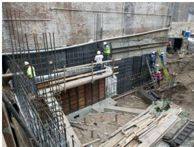
New Foundation Construction