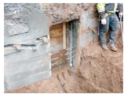
Continuous Internal Reinforcing of Underpinning Concrete