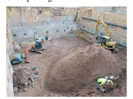
Nearly Complete Excavation-Preparation for Mat Foundation