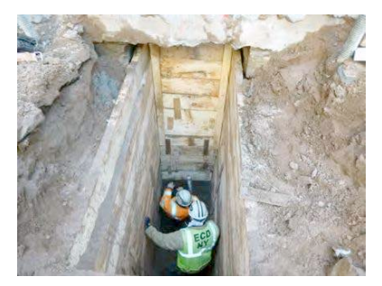
Titan Pile at Bottom of Underpinning Pit