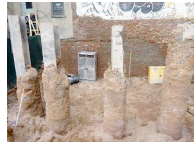
Soldier Pile Installed in Pre-drilled Holes with Grout Backfill