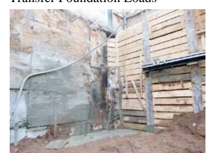
Excavation in Progress