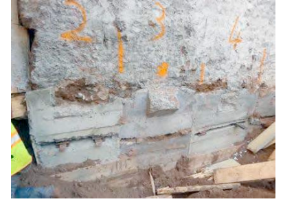
Steel Plates and Wedges to Transfer Foundation Loads